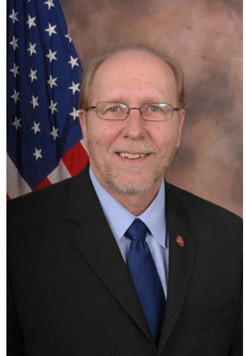
U.S. Representative Dave Loebsack (Mexico 1983, Brazil 1987) taught U.S. foreign policy at Cornell College in Mt. Vernon before being elected to office in 2005.

The University of Iowa is the perfect place to launch the Iowa Chapter of the Fulbright Association, and I welcome its students, and those throughout our state, to apply and participate in this excellent program.